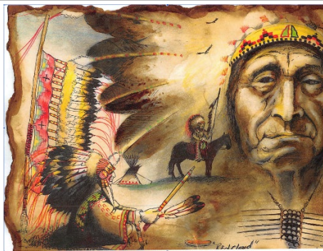
2 "Red Cloud"