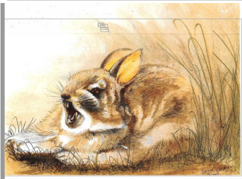
1 "Yawning Bunny"