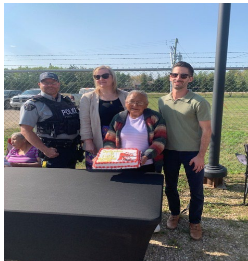
Celebrating FASD Awareness with our esteemed partners of Alexis Nakota Sioux Nation