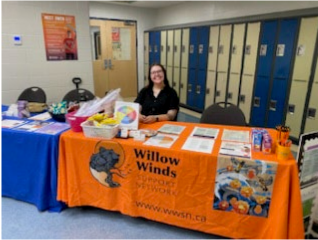
Representing for FASD Awareness Day at Hinton Elementary School, HELP