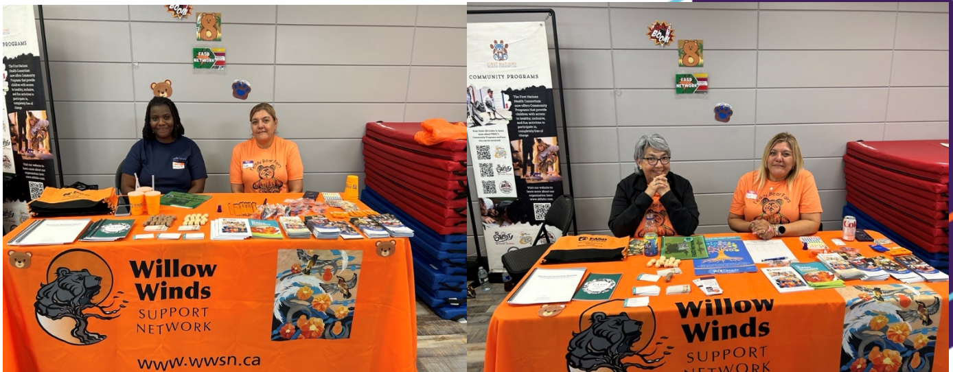
Wabasca/Desmarais Teddy Bear Fair