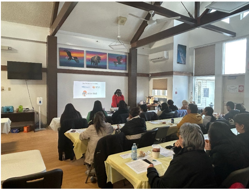
Wabasca Lunch and Learn, left