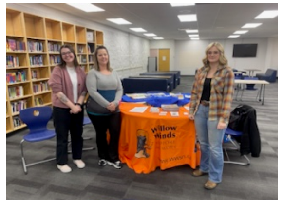
Transitions to Adulthood event at Harry Collinge High School, Hinton